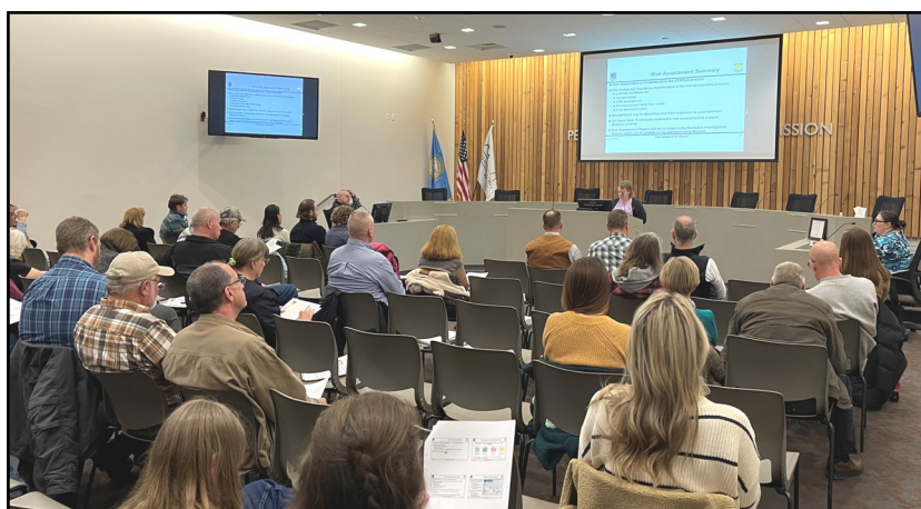
Community members listen to an Air Force presentation during the March 28, 2023 Town Hall Meeting.